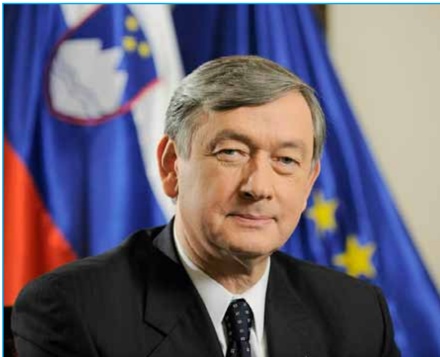
Dr. Danilo Türk.

Dr. Türk served as President of the Republic of Slovenia from 2007 to 2012 and was the first Slovenian Permanent Representative to the United Nations. During his tenure, Slovenia was a non-permanent member of the Security Council. Later, he was appointed U.N. Assistant Secretary-General for Political Affairs, before returning to Slovenia where in 2007 he was elected as the third President of Republic of Slovenia, in which office he served until 2012. A former professor and director of the Institute for International Law at the University of Ljubljana, Dr. Türk