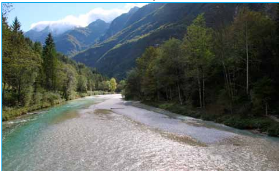
Soča River in the Bovec region (Source: www.slovenia.info ; Photographer: Nea Culpa d.o.o.).

With 60% of its area covered by forests, Slovenia is the third-most-forested country in Europe. Slovenia is also among the countries with abundant water resources. Forests, especially timber, represent one of the most important strategic natural resources in Slovenia. At the same time, they also contribute to the reduction of greenhouse gas emissions. The foundation of the good condition of Slovenian forests has been long-term forest management that takes into account the principles of sustainability, symbiosis with nature and the impact of climate