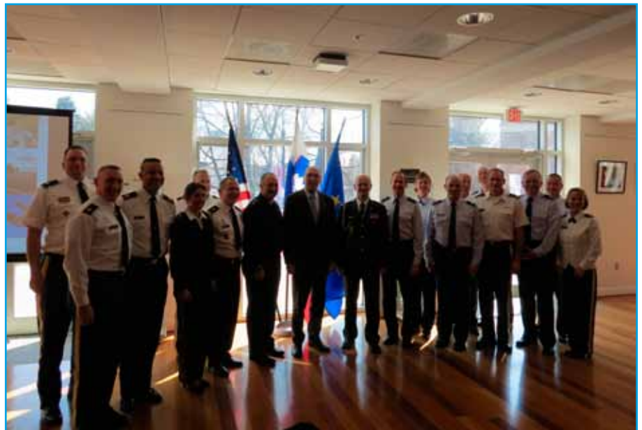
CONG senior military staff members at the embassy.