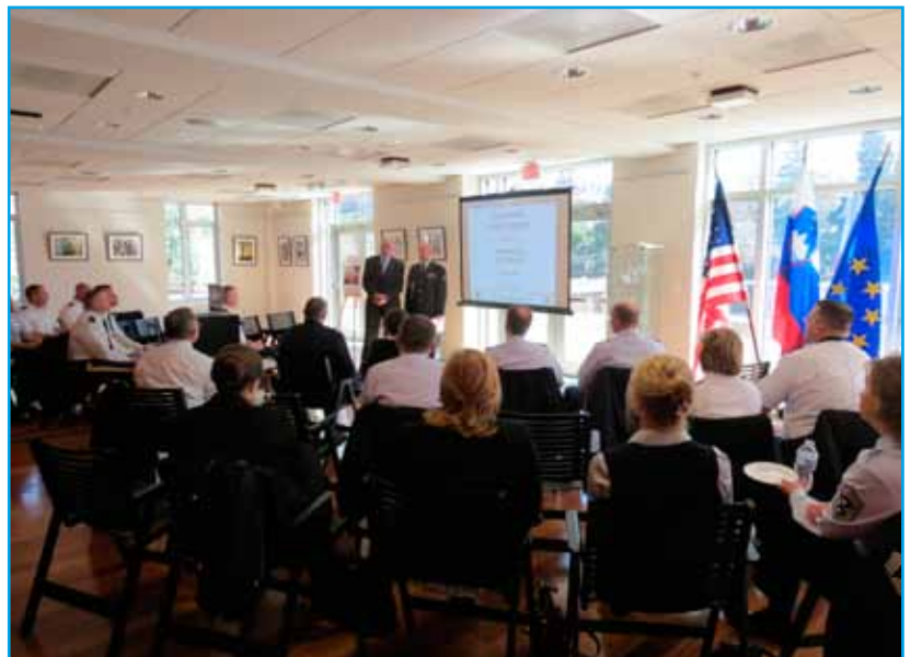
The meeting was dedicated to discussing the strengthening of future cooperation between the Slovenian Army (SV) and Colorado National Guard (CNG) within the framework of State Partnership Program.