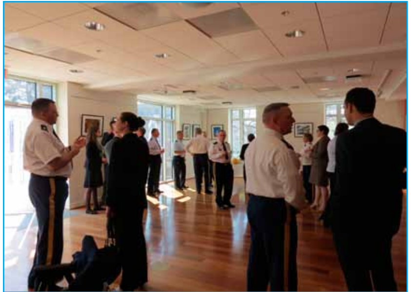
Colorado's partnership with the Republic of Slovenia began in 1993, when the Colorado National Guard was chosen to help Slovenia in meeting the NATO standards.

The peak in the partnership program was the exercise and training of members of the SV and CNG in Colorado and Slovenia for the operations and management of the OMLT (Operational Mentor and Liaison Team) in Afghanistan.