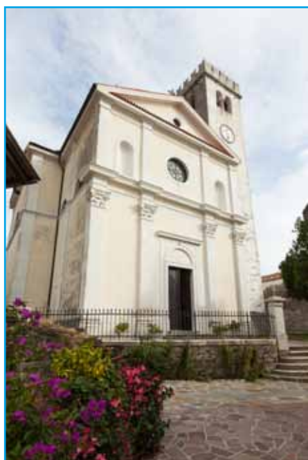
St. Martin's Church is the largest church in Brda, with a bell tower which was once a fortification tower.

Between the 16th and the second half of the 18th century, Šmartno was an important strategic defense post incorporated in the system of fortifications and never taken by the Venetians. The border was defended by contract soldiers coming from far away; many were of Uskok (Croatian) origin. The wall between the seven towers was built in a way that the passages were spacious enough to allow movement of soldiers in different directions. It seems that the settlement had a drawbridge in front of the entrance and was surrounded by a deep moat. Military origin of the village is also testified to by a crenellated church bell tower and by both squares – upper and lower square – which were intended for gathering of soldiers in case of an enemy assault through the main entrance. The village derives its name from St. Martin's Church, the largest church in Brda, with a