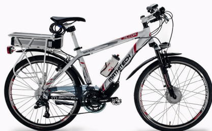
E Bike 4 Town