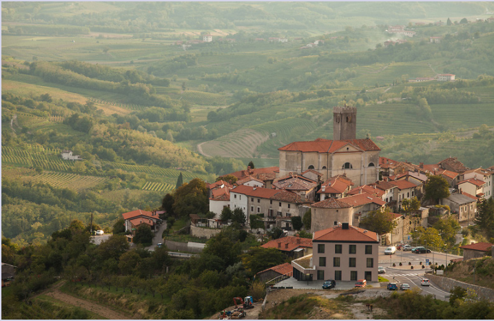
Slovenia offers height of culture.

populated by such silver screen stars as Orson Welles and Peter Ustinov, Slovenian Film Centre this year featuring for first time at American Film Market, US action thriller The Union recently shot with star-studded cast including Halle Berry and Mark Wahlberg, gulf resort among 17 locations nationwide, Tartini's Birth House also pilgrimage for fans of famous son Giuseppe, showcasing celebrated composer's violin virtuosity.