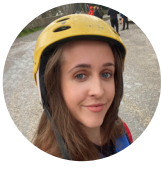
BY ISABELLA BONEHAM