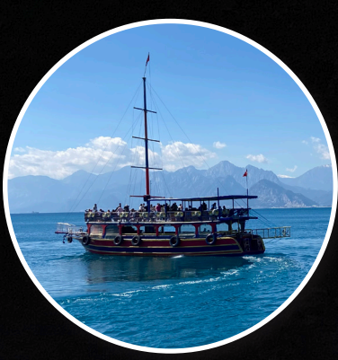
We explored the enchanting old town of Kaleici and had a stunning boat trip to see the Duden Waterfalls.