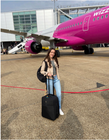
The only information I was given beforehand was that it would be 18 to 20 degrees and I would need to pack some swimwear and hiking gear.

had exquisite food including squid, sushi and an amazing aquarium in the middle which had a variety of majestic sharks. The next day we explored the enchanting old town of Kaleici which was really charming, visiting the likes of the almost 2,000 years old Hadrian's Gate.