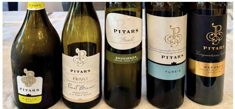
Pitars presentation at Ristorante Al Pellegrino

tangy and juicy, with dark berry flavors